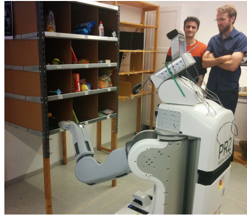
Fig. 1. Team CVAP's PR2 robot platform used for the Amazon Picking Challenge 2015 in Seattle, USA.

We used the PR2 research robot from Willow Garage shown in Fig. 1 for the 2015 APC competition. The robot consists of two 7-DOF manipulators attached to a height-adjustable torso and equipped with parallel-jaw grippers. A pan-tilt controllable robot head is located on the upper part of the robot and equipped with a set of RGB cameras and a Kinect camera which we used in our object segmentation system. The robot is also equipped with a tilt-controllable laser scanner located right beneath the head which we also used for object segmentation purposes. A set of 4 wheels at the base provides the robot with omnidirectional mobility, which we exploited in order to control the robot back and